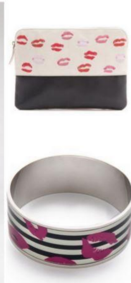
ERIN FETHERSTON @ lyst.com; MARC by MARC JACOBS iPhone case @ bloomingdales.com; top: LIZZIE FORTUNATO @ theenglishroom.biz; bottom: MARC by MARC JACOBS @ theenglishroom.biz

Lipstick impressions: Prints and accessories look as though they have just been planted with kisses and the effect can be bold or delicate. Lipstick prints appear softly faded onto sheer blouses in shades of pink and red, these patterns have a random-style repeat - a monochrome version would work for men's shirts. Prints with a deeper colour saturation are printed on top of bold black and white stripes and add a novelty element to accessories.